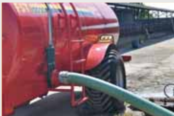
Manual suction system