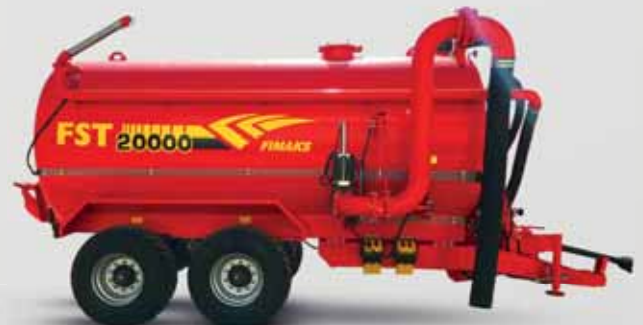
20.000 LT SLURRY TANKER FST 20000