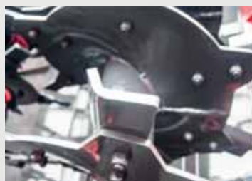
Specially designed blades