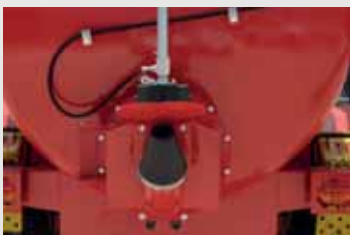
Adjustable spraying plate