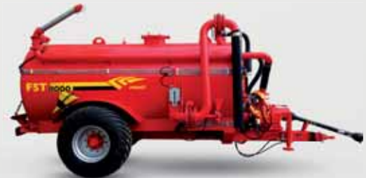
8000 LT SLURRY TANKER FST 8000