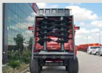
Specially designed beaters