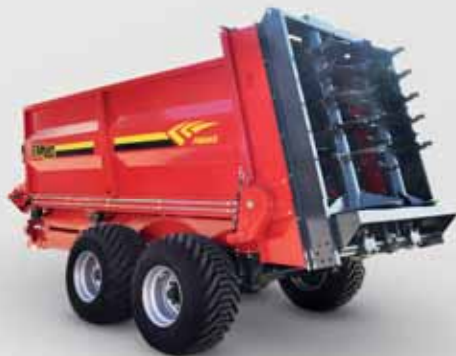
18 TONS MANURE SPREADER FMGR 18