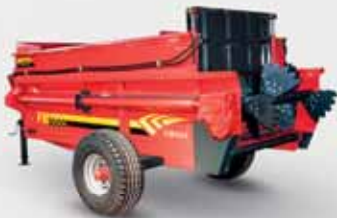
4 TONS MANURE SPREADER FMGR 3