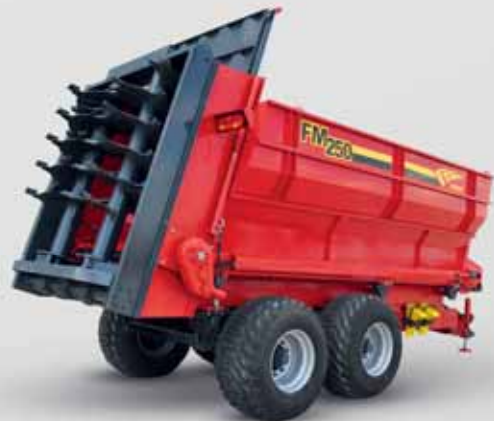
25 TONS MANURE SPREADER FMGR 25