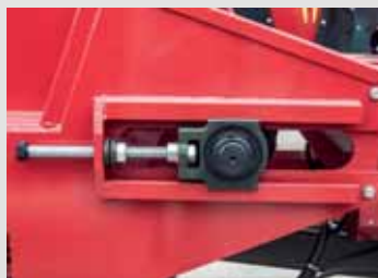
Chain tension system