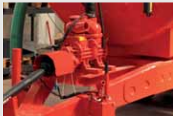
Strong Italian pumps