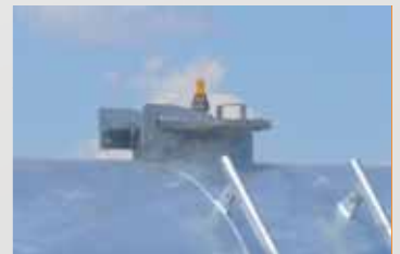
High pressure valves