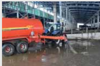
Hydraulic suction system