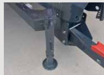
Adjustable support jack