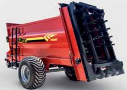
10 TONS MANURE SPREADER FMGR 10