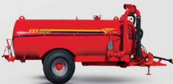
10.000 LT SLURRY TANKER FST 10000