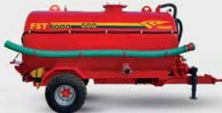
6000 LT SLURRY TANKER FST 6000

7- Hydraulic brake is standard for FST 20000 and optional for other models.