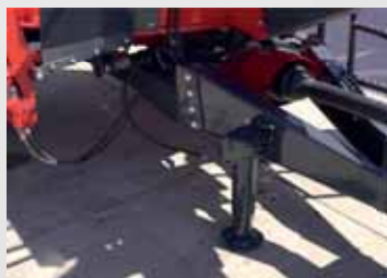
Support jack with pump