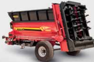
5 TONS MANURE SPREADER FMGR 5